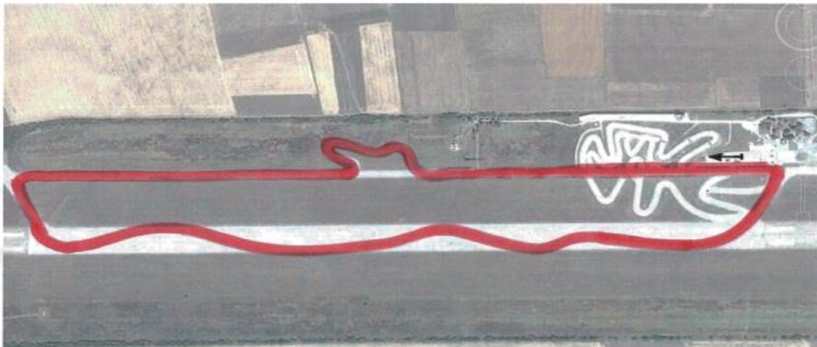
AIRPORT DOLNA MITROPOLJA WIDTH 15M. LENGTH 3300M.